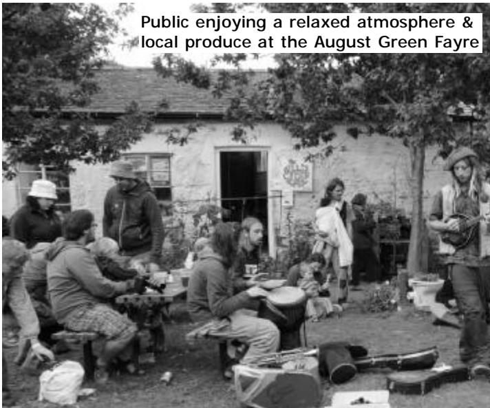
Public enjoying a relaxed atmosphere & local produce at the August Green Fayre

* We have even launched our own LETS currency the Dolydd and are planning for a conference on alternative economics in 2010.