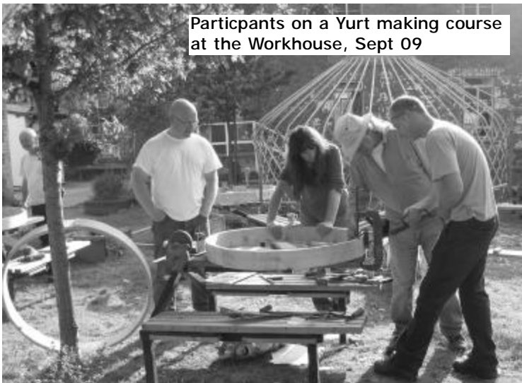
Participants on a Yurt making course at the Workhouse, Sept 09

Coming up for this year, and key to our new business plan we are launching a Workhouse courses programme. Building on the success of the yurt making, youth arts and permaculture design the Workhouse is developing a range of short courses in subjects from organic gardening to stone-carving. See details on back page.